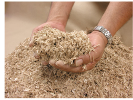
CARBON NEUTRAL FUELS

Advanced Technology Complete monitoring and logic programming for efficient clean combustion. Touch screen interface. (Controls complete boiler system)