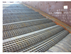
SUPERIOR STOKER DESIGN